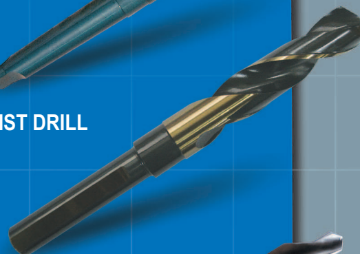
HSS(M2) 118° SPLIT POINT 3FLAT BLACK&GOLD SILVER&DEMING DRILL