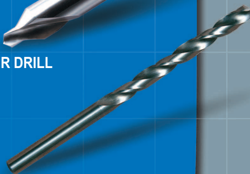
CARBIDE JOBBERS LENGTH TWIST DRILL

BEST VALUE IN THE WORLD OF CUTTING TOOLS